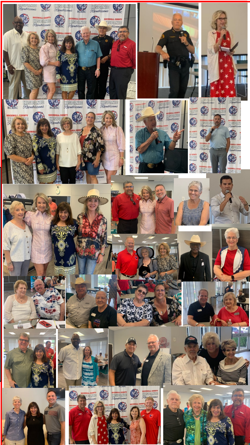
Secure the Border Meeting & Thank you Kaufman County for hosting RCRHC

Republican Women of Van Zandt, GOTV & Election Integrity Training, August 2, 2022, Tuesday, Van Zandt County Country Club $15 In-