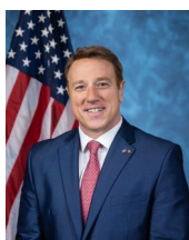
For Texas & Liberty - Congressman Pat Fallon

The time to secure our border and make our communities safer is well overdue. It’s not until this Administration recognizes that border security is national security, that we will begin to make progress. In the meantime, I can promise you this—as long as I am your representative in Congress, I will do everything in my power to secure our southern border!