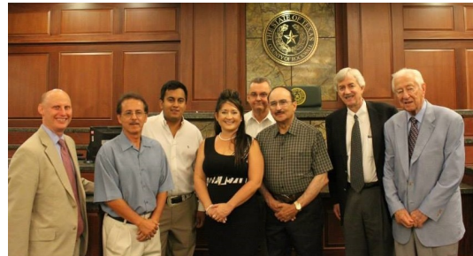
RCRHC— District Judge Brett Hall Com- missioned RCRHC Club